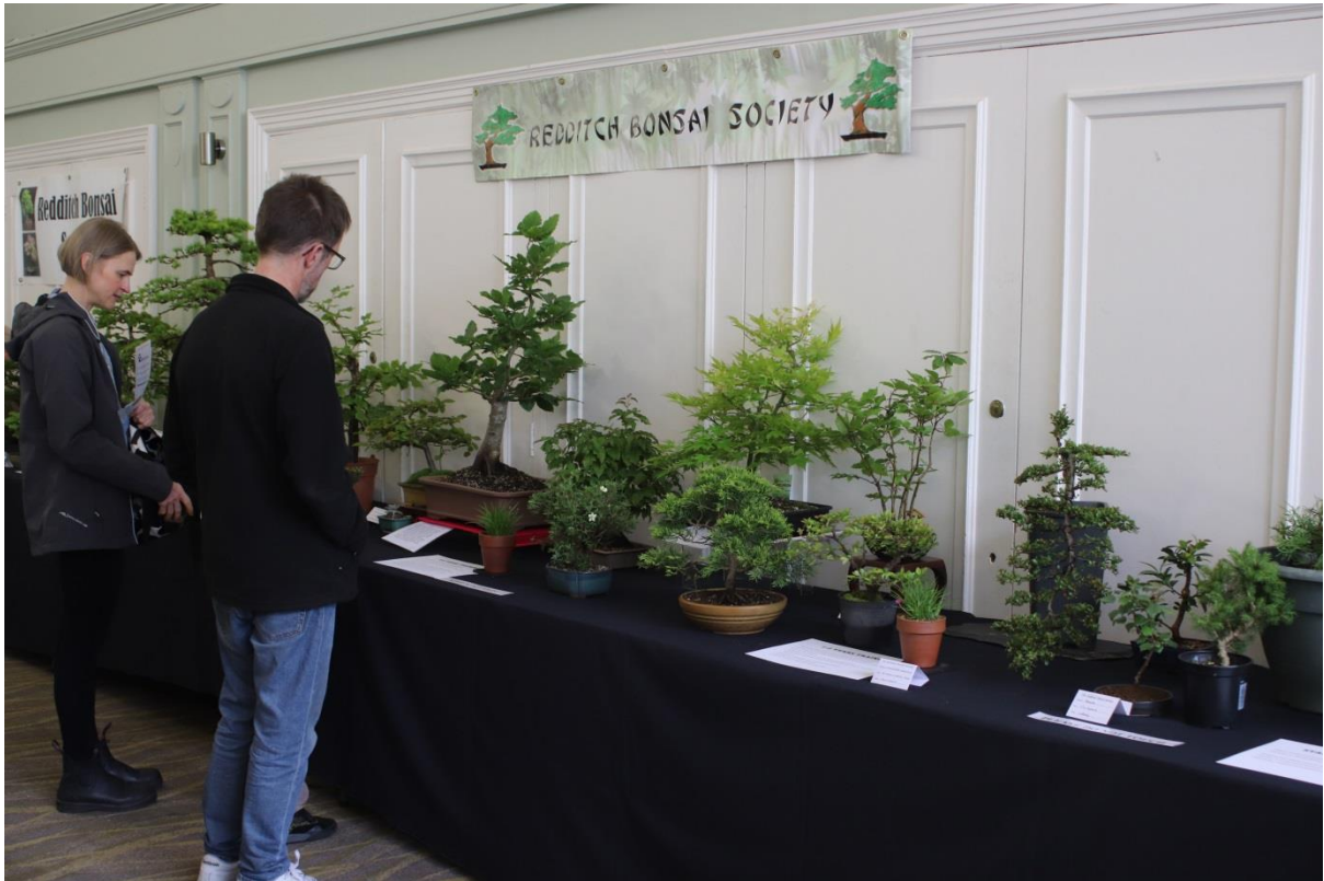
Redditch Bonsai Society (RBS) put on a splendid display by the main entrance to the exhibition hall.