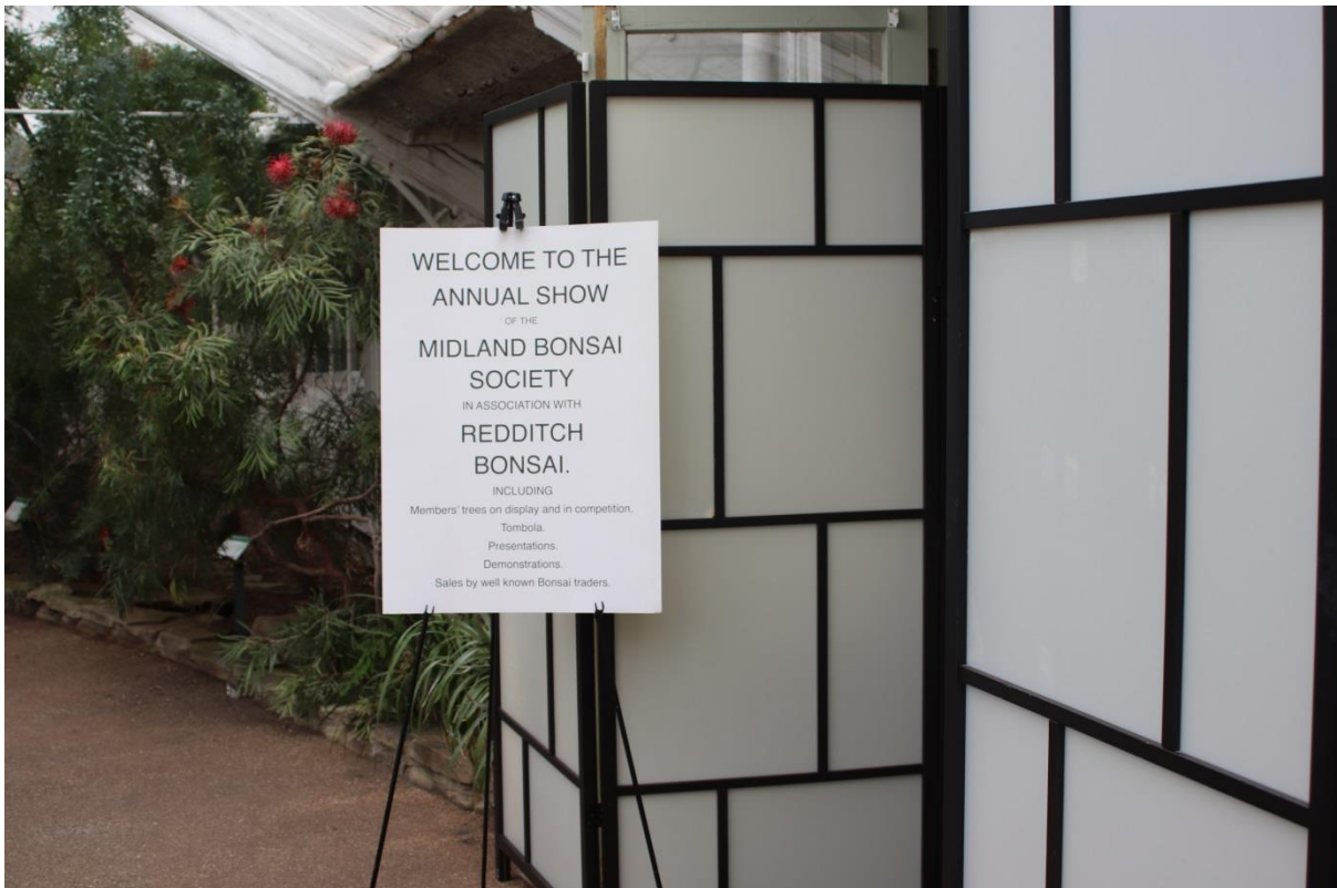
They were also used, as seen here by the Redditch Bonsai Society (RBS) Display, to compliment the Master Class section.